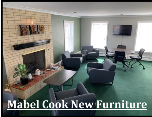
Mabel Cook New Furniture

P-3 Central Plant Modernization Project Update - We are pleased that six firms submitted Request for Qualifications documents (RFQ's) for the University's consideration. The internal P-3 committee (members of finance and facilities) are currently attending verbal presentations by the respondents and will soon narrow to a top two or three to move forward to the next steps in the selection process.