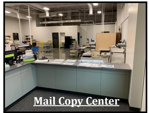
Mail Copy Center