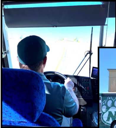
Driving the pep band, cheerleader and dazblers to the men's basketball National Championship