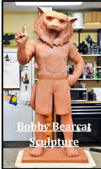
Bobby Bearcat Sculpture